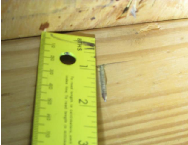
Roof Deck Attachments: 8d nails @ max. 6"