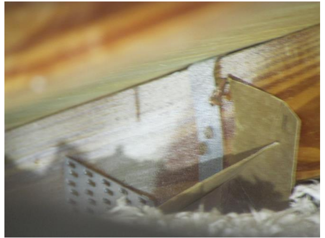
Roof Wall Attachments: Wraps with 3 nails