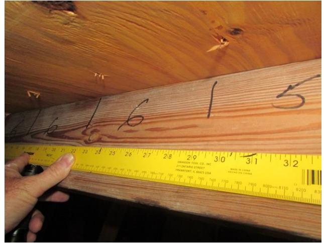
Roof Deck Attachments: 8d nails @ max. 6"