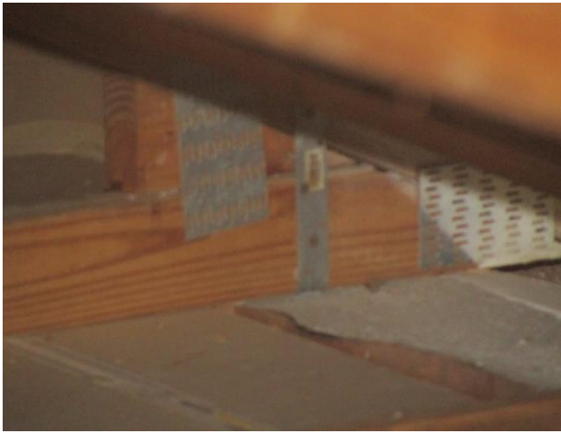
Roof Wall Attachments: Wraps with 3 nails