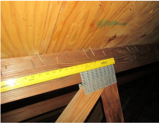
Roof Deck Attachments: 8d nails @ max. 6"