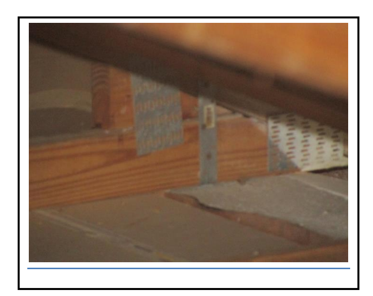
Roof Wall Attachments: Wraps with 3 nails