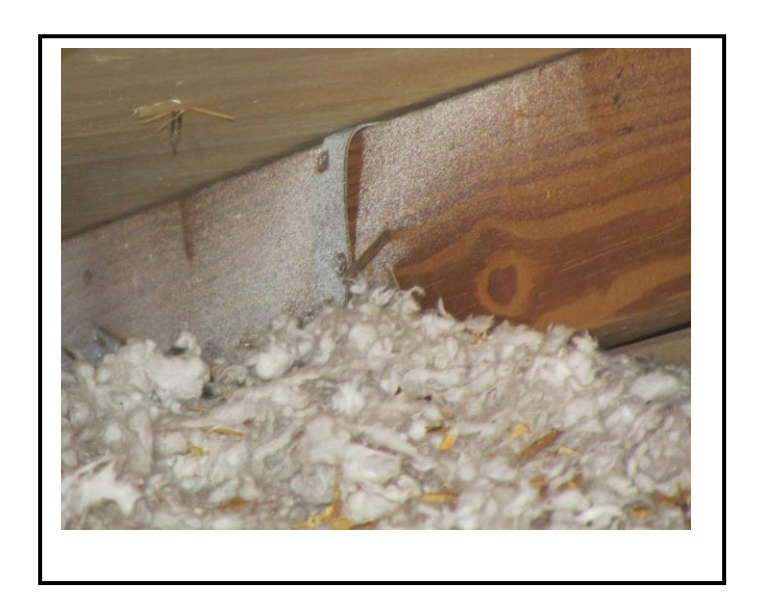
Roof Wall Attachments: Wraps with 3 nails