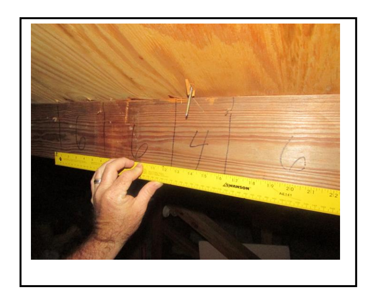
Roof Deck Attachments: 8d nails @ max. 6"