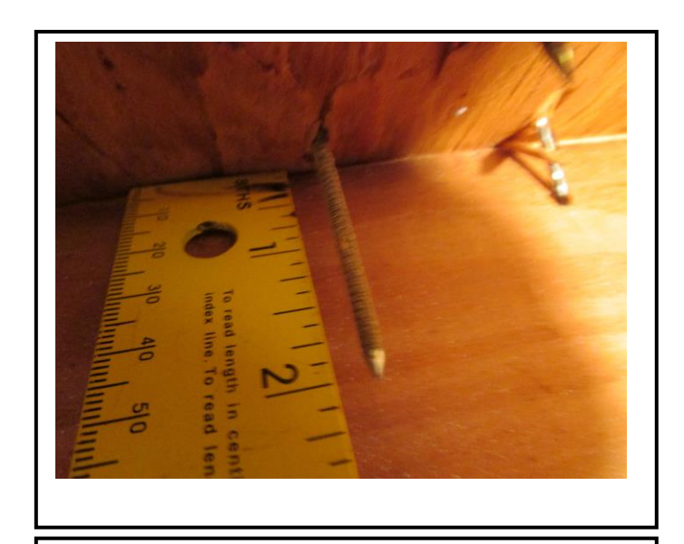
Roof Deck Attachments: 8d nails @ max. 6"