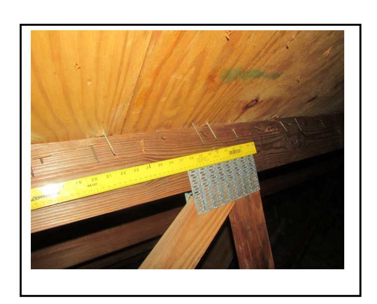
Roof Deck Attachments: 8d nails @ max. 6"