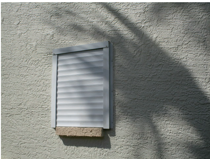
non impact windows- some w/protection