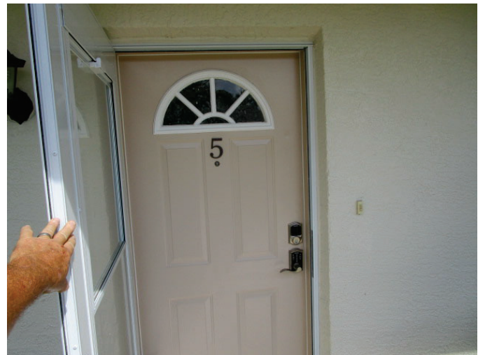
metal clad non impact entrances