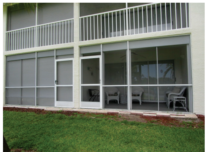
non impact sliders- some w protection