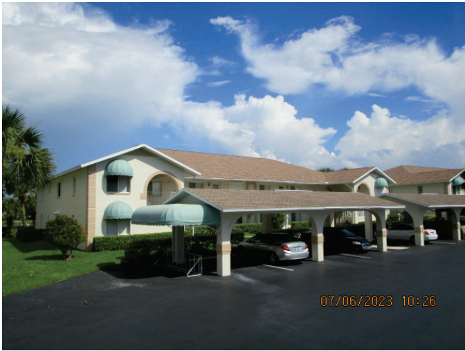
Turquoise at Sapphire Lakes Condo: 185 Gabriel Cir Naples