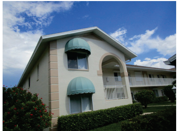
roof geometry: "other" style roof *40' gables vs 360 ttl roof