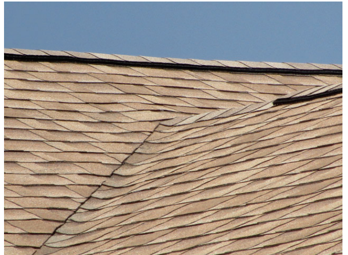
2006 dimensional asphalt shingle "other" style roof