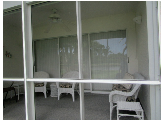
non impact sliders