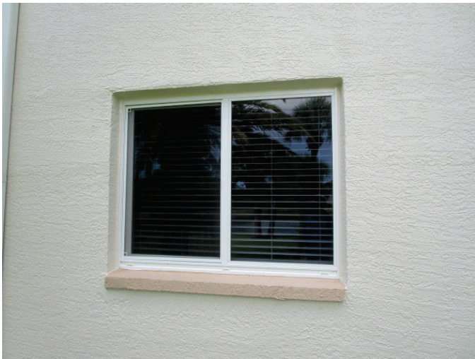
non impact windows