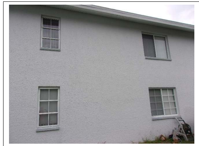
OPENING PROTECTION – Although some unit owners have installed wind-borne debris protection devices, others have not, leaving some of the openings (hinged entry doors, windows & sliding doors) unprotected