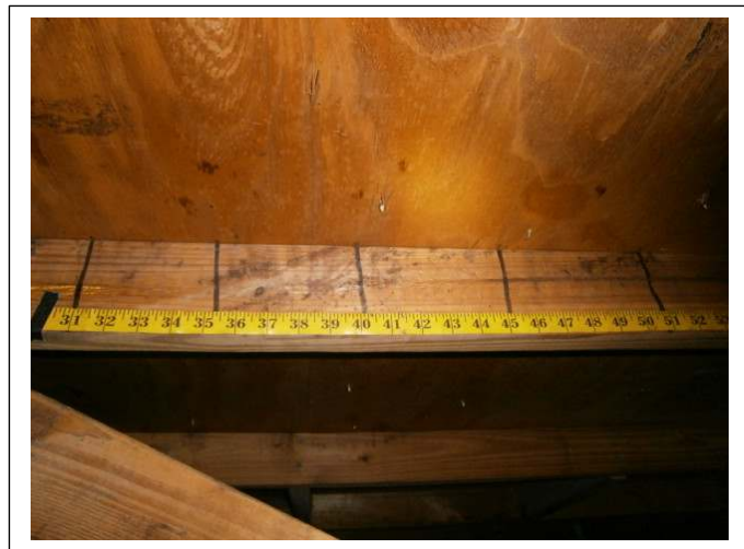
ROOF DECK ATTACHMENT – 8d nails within 6 inches in the field