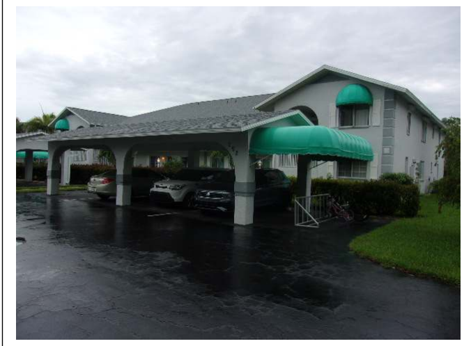
FRONT ELEVATION VIEW

R3 of Florida, LLC P.O. Box 152205 Cape Coral, FL 33915 Office: 239.810.7793 Email: radjrsas@yahoo.com