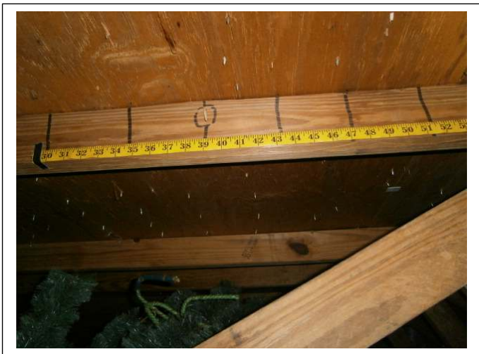
ROOF DECK ATTACHMENT – 8d nails within 6 inches along the edge