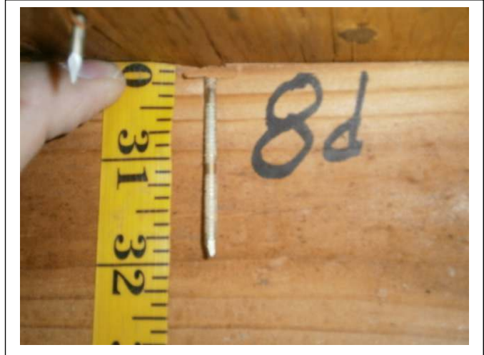
ROOF DECK ATTACHEMNT – 8d ring shank nails added in 2022