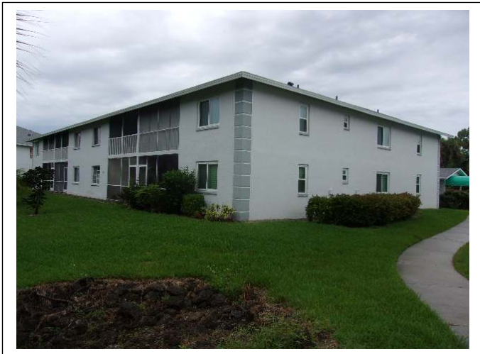
REAR ELEVATION VIEW