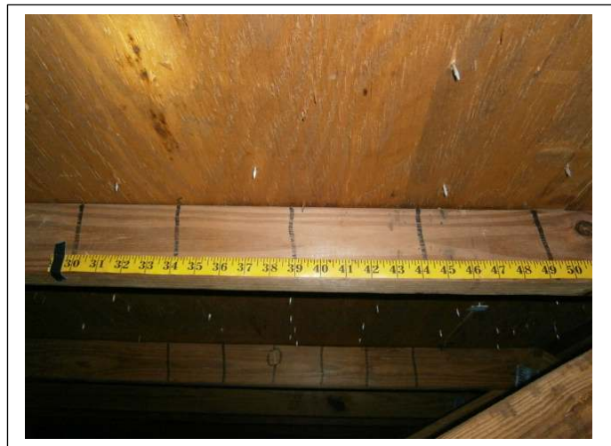
ROOF DECK ATTACHMENT – 8d nails within 6 inches in the field