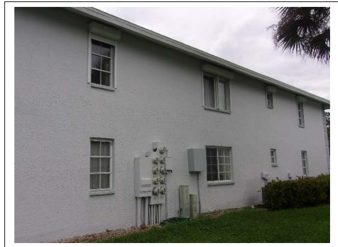
OPENING PROTECTION – Although some unit owners have installed wind-borne debris protection devices, others have not, leaving some of the openings (hinged entry doors, windows & sliding doors) unprotected