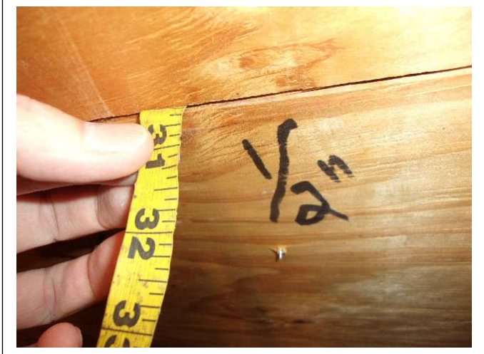
ROOF DECK THICKNESS – ½ inch plywood

R3 of Florida, LLC P.O. Box 152205 Cape Coral, FL 33915 Office: 239.810.7793 Email: radjrsas@yahoo.com