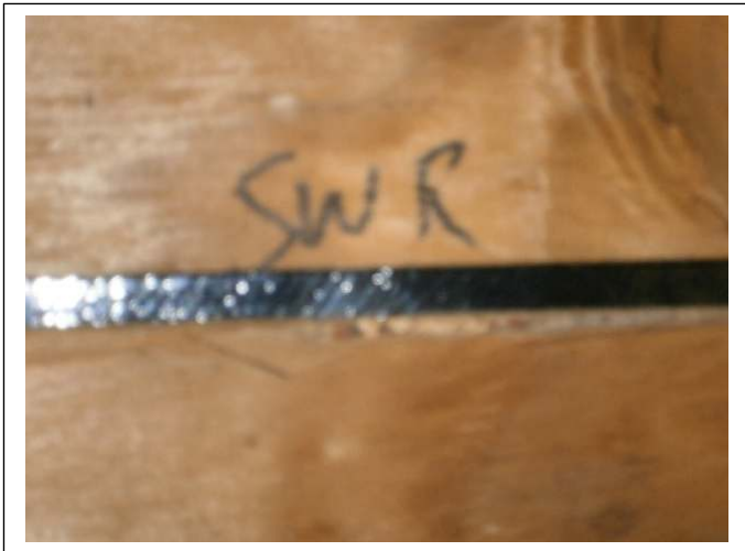
SECONDARY WATER BARRIER – A polymer adhesive (peel & stick) SWR Barrier was installed on the entire roof deck in 2022