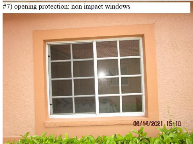
#7) opening protection: non impact windows