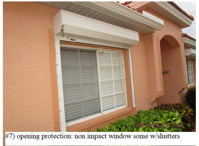
#7) opening protection: non impact window some w/shutters