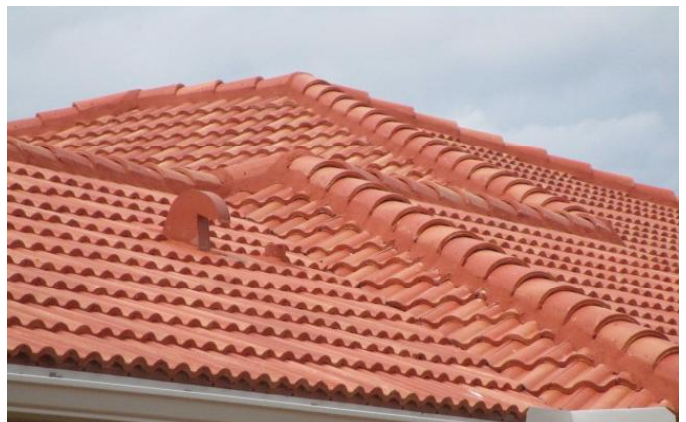
#2) roof covering: 2020 TILE HIP style roof PRBD2020-0731283 applied 7/31/2020