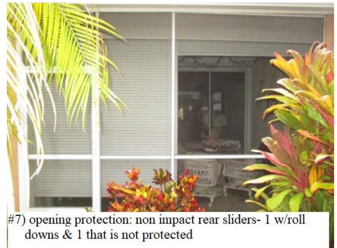
#7) opening protection: non impact rear sliders- 1 w/roll downs & 1 that is not protected