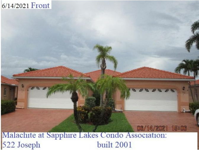
Malachite at Sapphire Lakes Condo Association: 522 Joseph built 2001