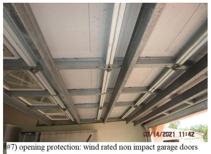
#7) opening protection: wind rated non impact garage doors