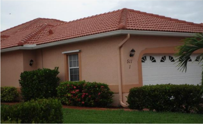
#5) roof geometry: HIP style roof **wall type construction: 100% reinforced masonry