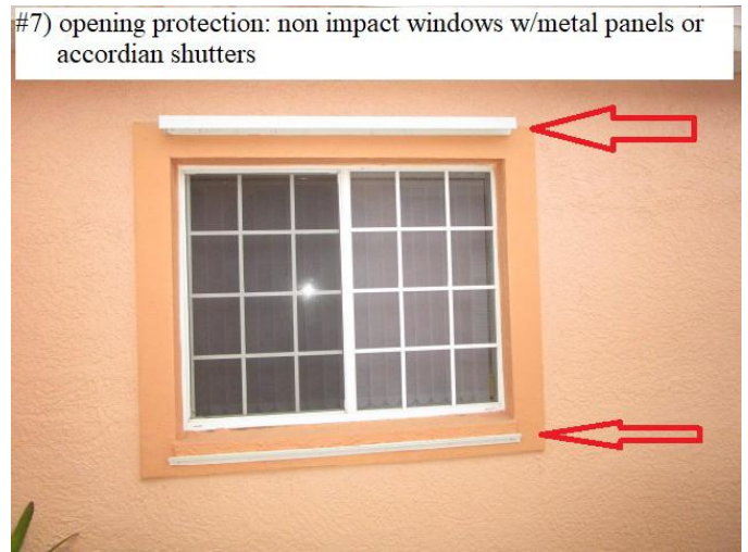
#7) opening protection: non impact windows w/metal panels or accordion shutters