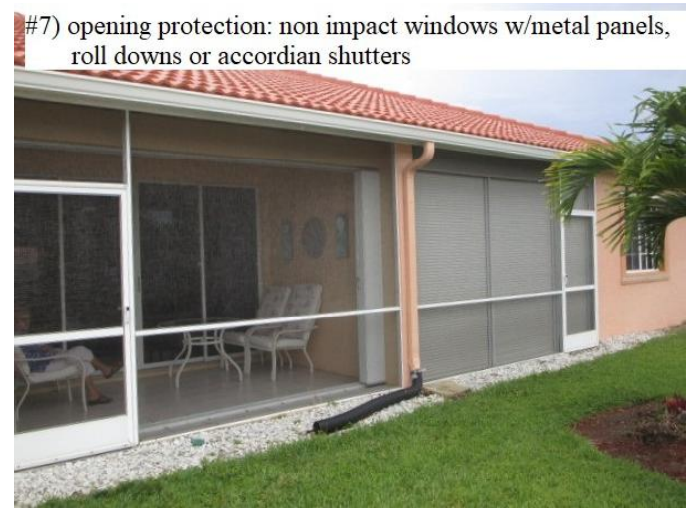
#7) opening protection: non impact windows w/metal panels, roll downs or accordion shutters