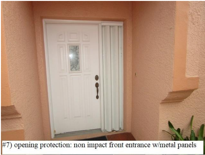
#7) opening protection: non impact front entrance w/metal panels