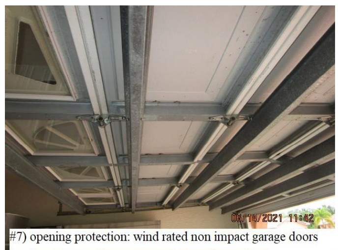
#7) opening protection: wind rated non impact garage doors