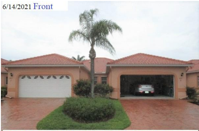
Malachite at Sapphire Lakes Condo Association: 511 Joseph built 2001