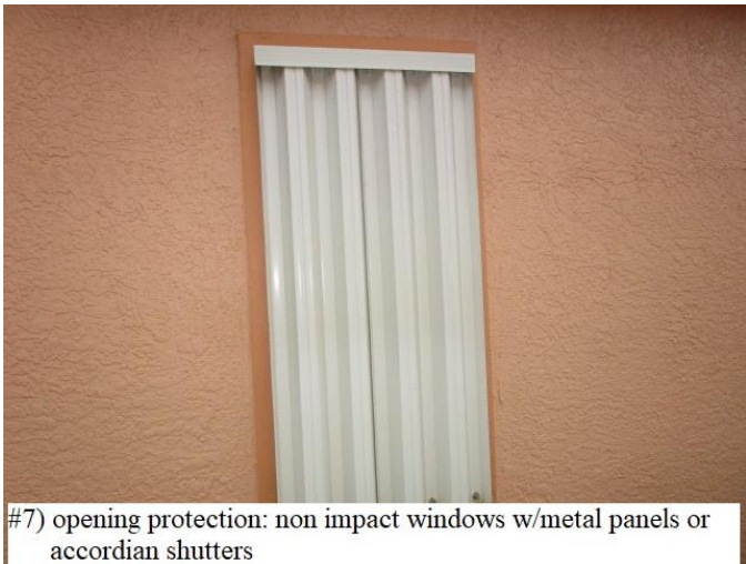
#7) opening protection: non impact windows w/metal panels or accordion shutters