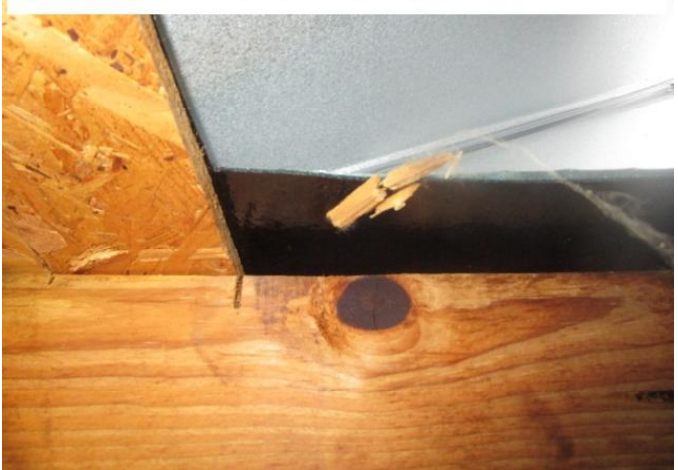
#6) secondary water barrier as viewed from the attic