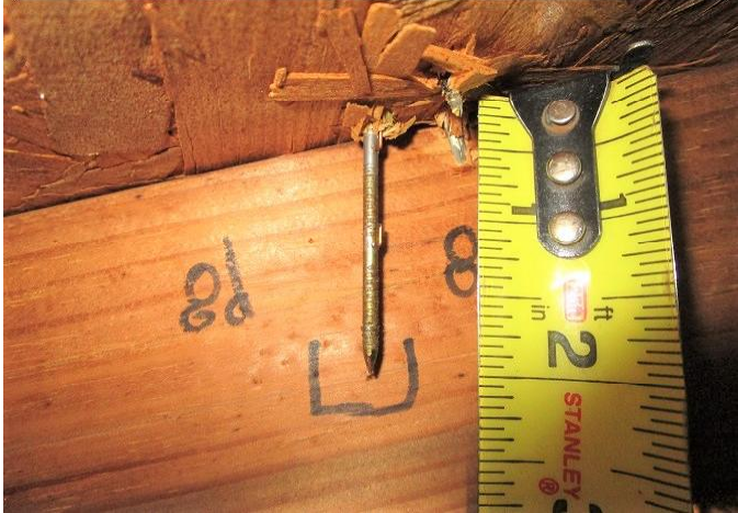
#3) roof deck attachment: 8d nails