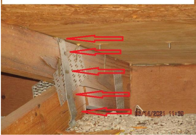
#4) roof to wall attachment: single wraps- front view