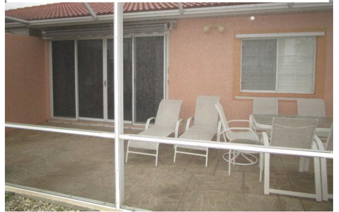
#7) opening protection: non impact rear sliders w/roll downs or metal panels