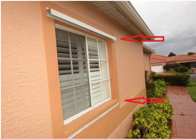
#7) opening protection: non impact windows w/metal shutters