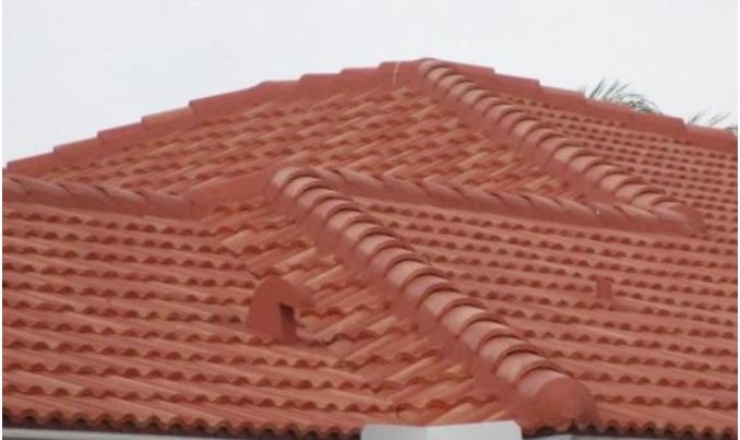
#2) roof covering: 2020 TILE HIP style roof PRBD2020-0731312 applied 7/31/2020