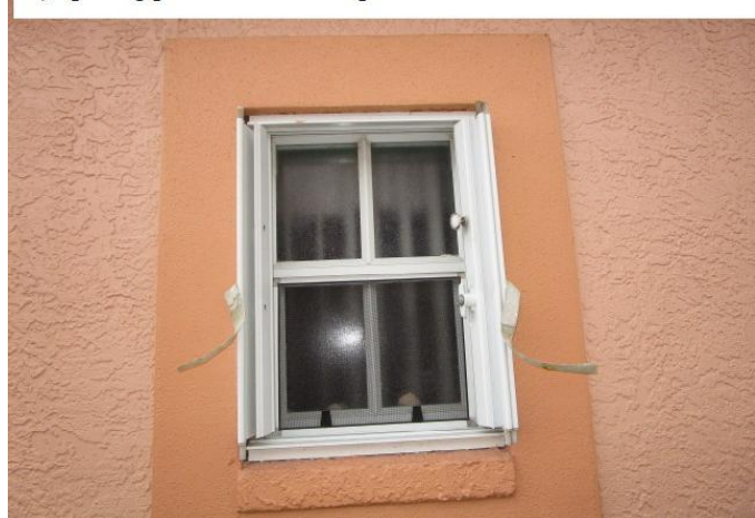
#7) opening protection: non impact windows w/accordion shutters