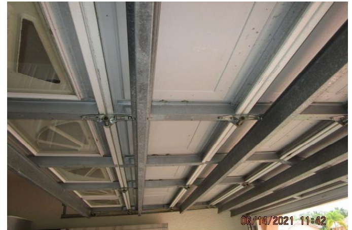
#7) opening protection: wind rated non impact garage doors