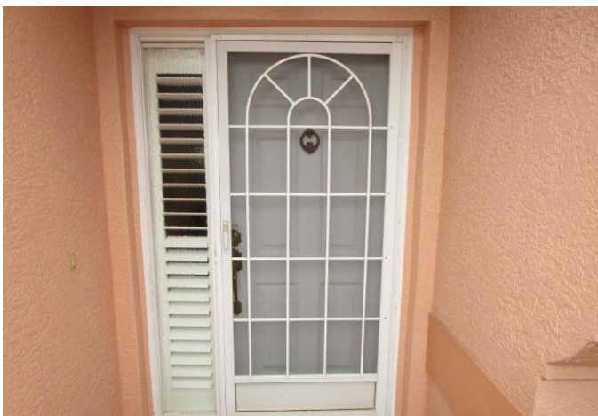
#7) opening prttection: non impact front entrances