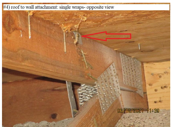
#4) roof to wall attachment: single wraps- opposite view