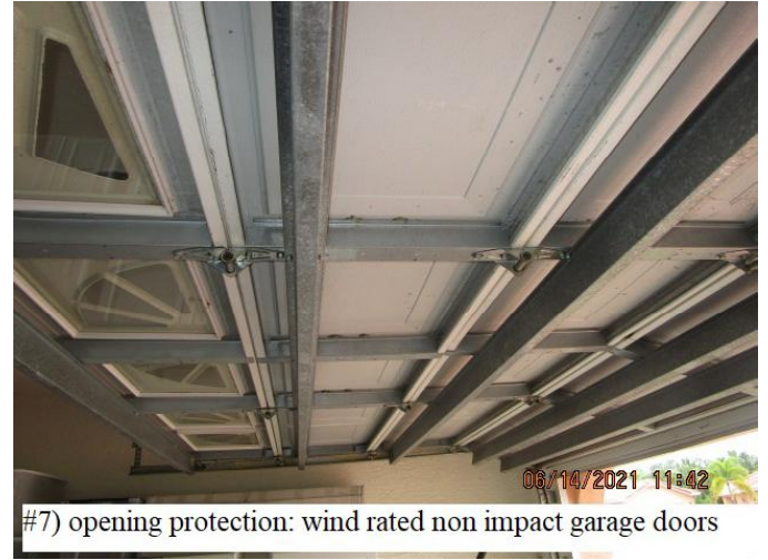
#7) opening protection: wind rated non impact garage doors