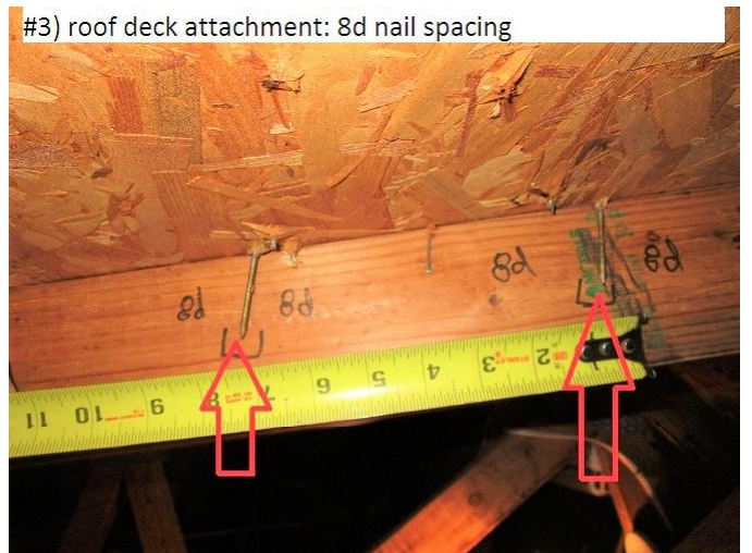
#3) roof deck attachment: 8d nail spacing