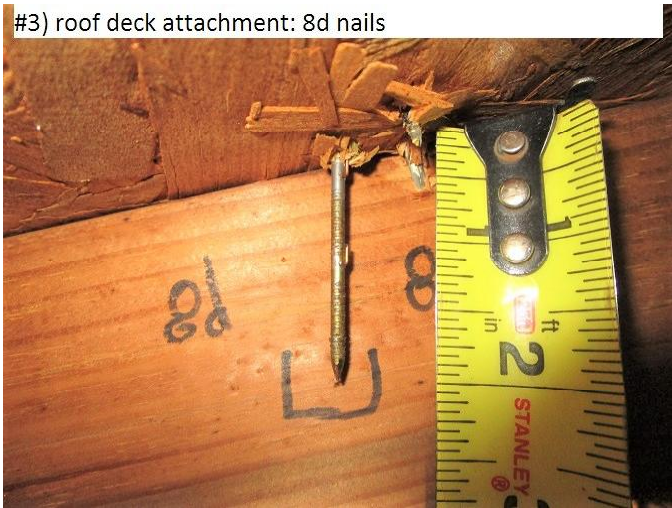
#3) roof deck attachment: 8d nails