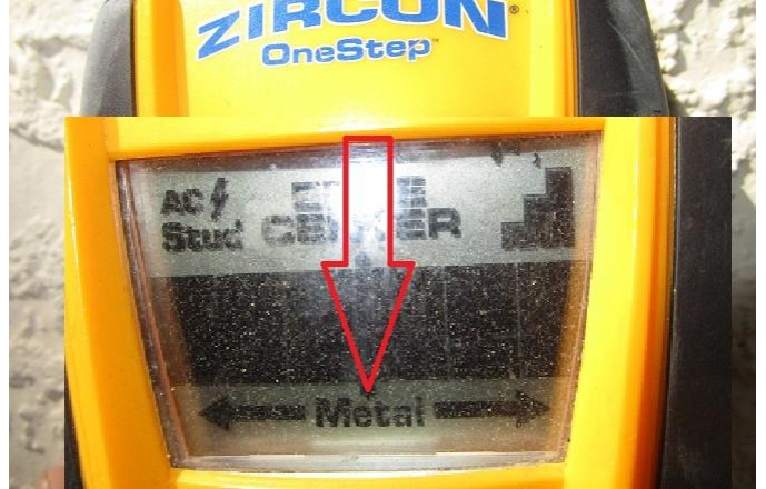
**wall type construction: 85% reinforced masonry