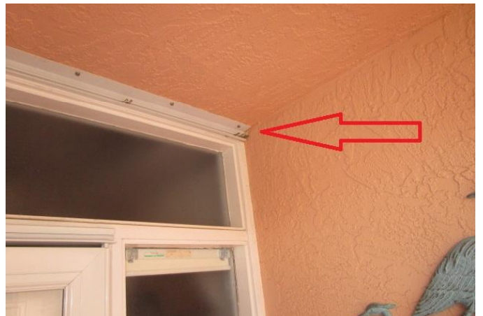
One front entrance has tracks for metal panels