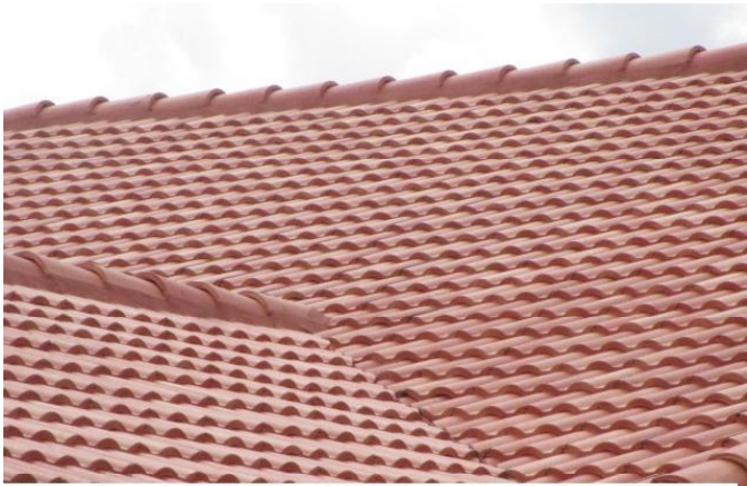
#2) roof covering: 2020 TILE HIP style roof PRBD2020-0731317 applied 7/31/2020