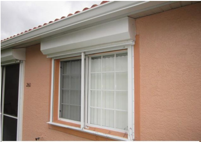
#7) opening protection: non impact windows w/roll downs