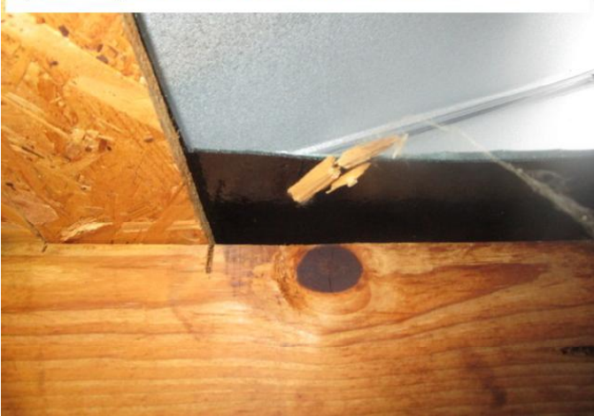
#6) secondary water barrier as viewed from the attic