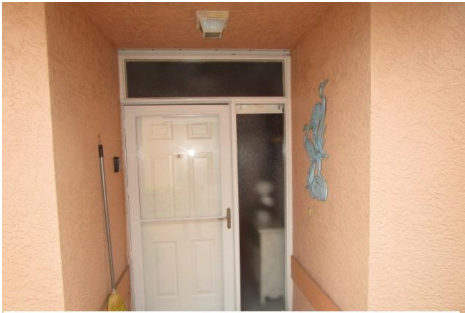
#7) opening protection: metal clad door w/non impact transom & sidelite windows