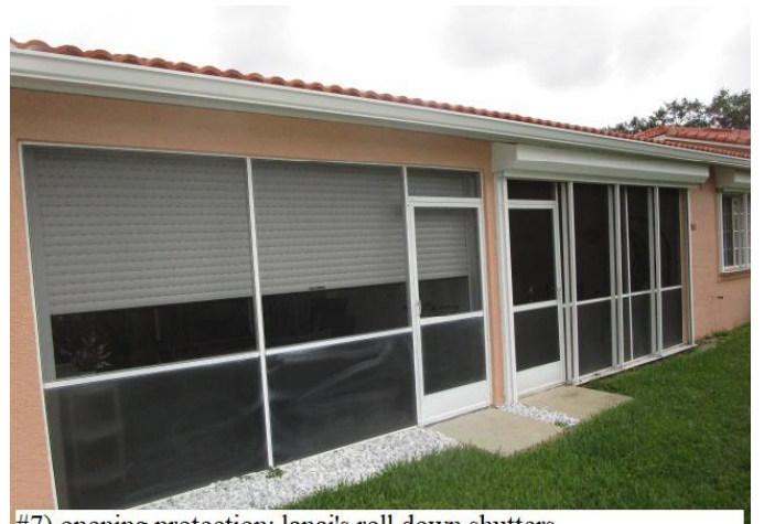
#7) opening protection: lanai's roll down shutters