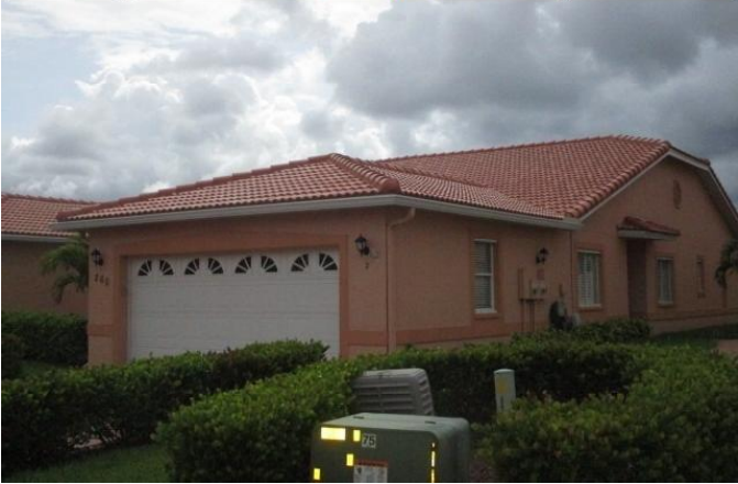
#5) roof geometry: "other" style roof **wall type construction: 85% reinforced masonry