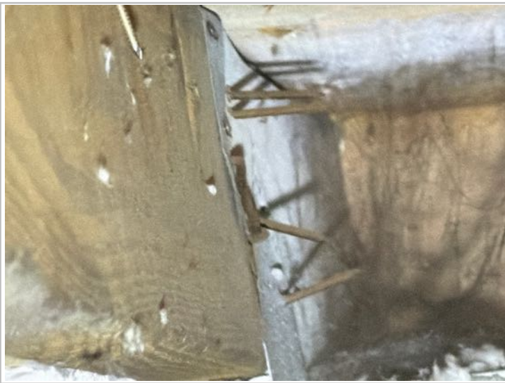
Strap- Opposing Side