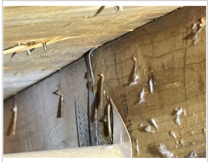
Strap- Anchor Side