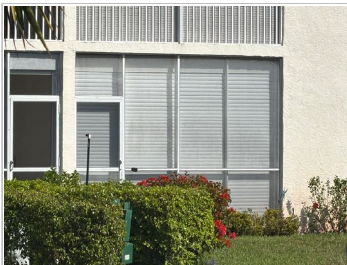
Impact Rated Protective Device