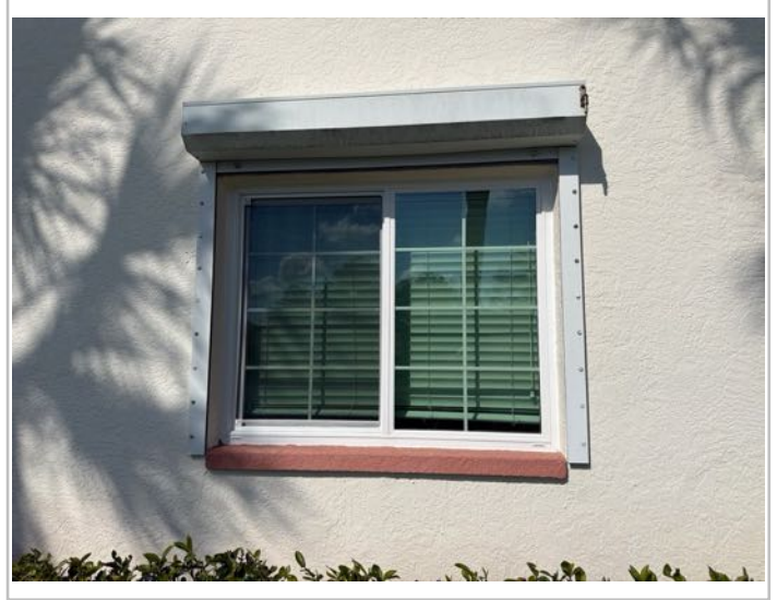
Impact Rated Protective Device