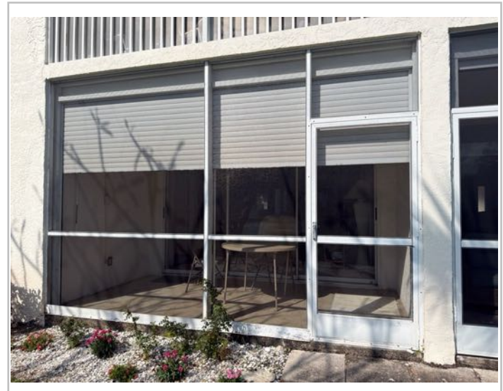
Impact Rated Protective Device