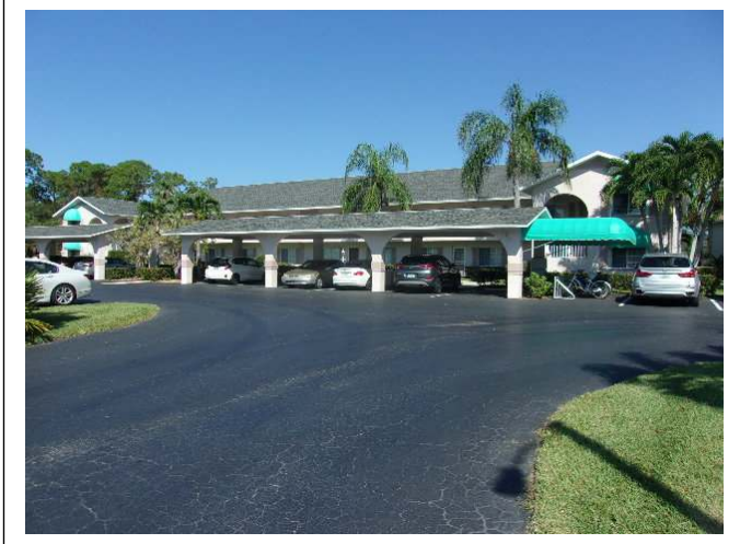
FRONT ELEVATION VIEW

R3 of Florida, LLC P.O. Box 152205 Cape Coral, FL 33915 Office: 239.810.7793 Email: radjrsas@yahoo.com