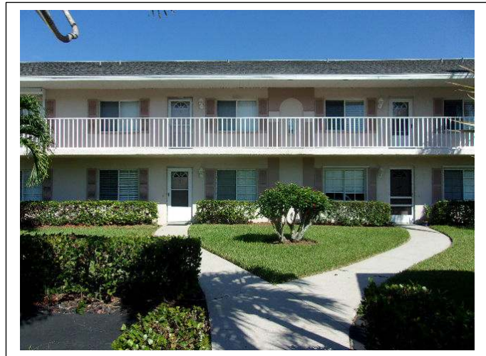
OPENING PROTECTION – Although some unit owners have installed wind-borne debris protection devices, others have not, leaving some of the openings (hinged entry doors, windows & sliding doors) unprotected