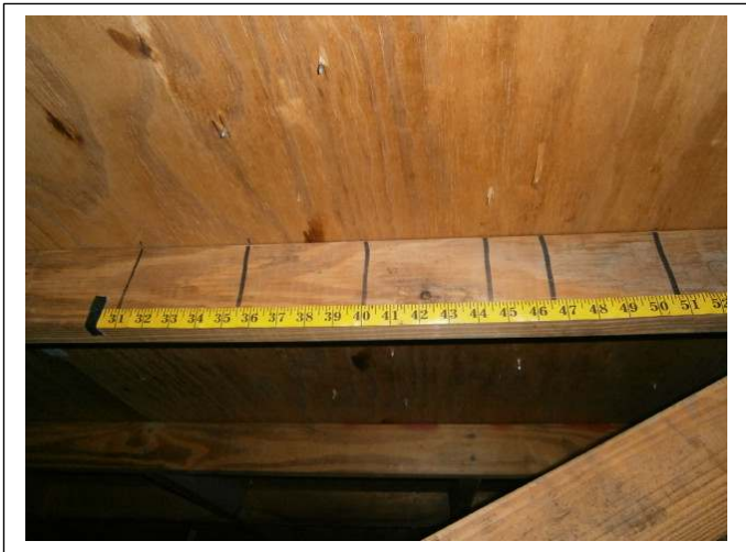
ROOF DECK ATTACHMENT – 8d nails within 6 inches along the edge