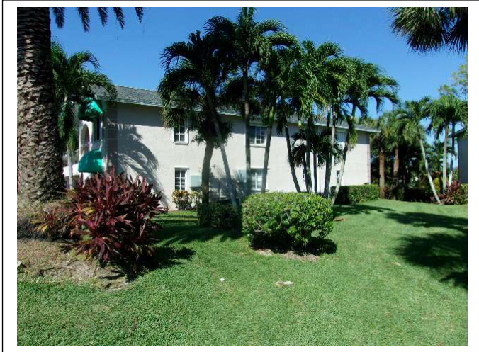
SIDE ELEVATION VIEW