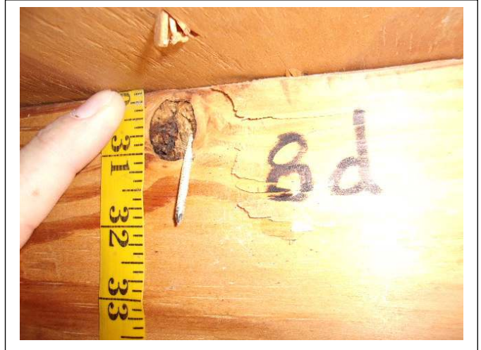
ROOF DECK ATTACHEMNT – 8d ring shank nails added in 2022