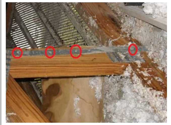
ROOF TO WALL ATTACHMENT – Properly installed Clips

R3 of Florida, LLC P.O. Box 152205 Cape Coral, FL 33915 Office: 239.810.7793 Email: radjrsas@yahoo.com