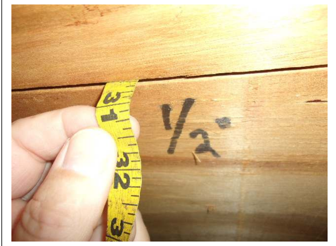
ROOF DECK THICKNESS – ½ inch plywood

R3 of Florida, LLC P.O. Box 152205 Cape Coral, FL 33915 Office: 239.810.7793 Email: radjrsas@yahoo.com