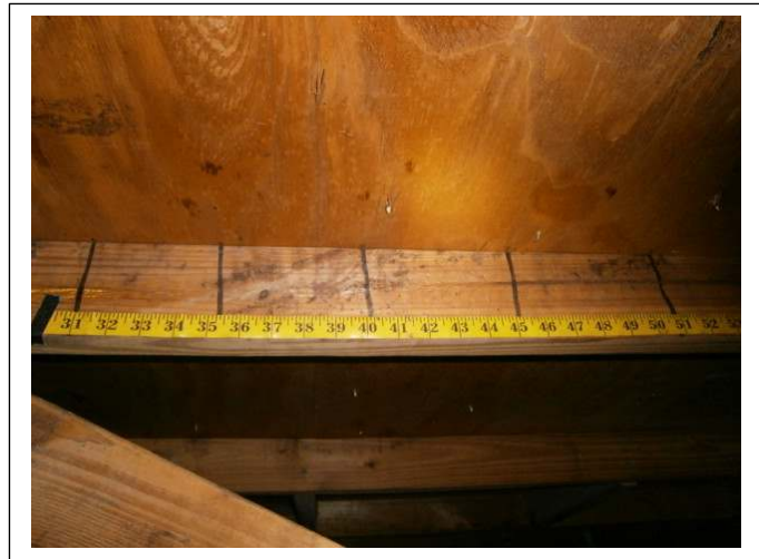
ROOF DECK ATTACHMENT – 8d nails within 6 inches in the field