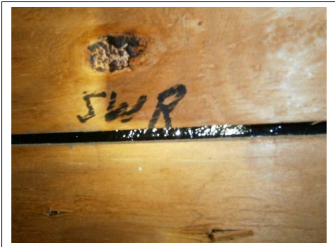
SECONDARY WATER BARRIER – A polymer adhesive (peel & stick) SWR Barrier was installed on the entire roof deck in 2022