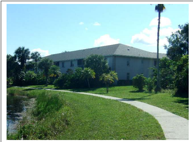
REAR ELEVATION VIEW