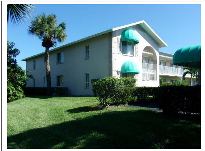
SIDE ELEVATION VIEW

Amber at Sapphire Lakes Condominium Association, Inc. 121 Gabriel Circle, Naples, FL 34104 09-20-2022